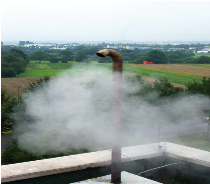
Fig. 2 Exhaust Vapour Outlet

In practice, the exhaust volume flow is very often set empirically – the real losses are usually unknown. It is only possible to determine the actual losses by means of elaborate measurement techniques. They involve condensing the exhaust vapours and measuring the amount of condensate. Figures from a number of boiler houses suggest losses of 0.15 % to > 3 % of nominal boiler output are common. The steam demand of a typical deaerator can be considerable in relation to the amount of useful steam produced. In situations where the steam demand is low or inconsistent with the degasser running continuously, the absolute losses can be enormous. (Fig. 2).