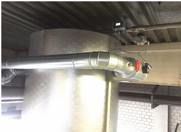
Fig. 3 Installation

Continuously monitoring oxygen levels in the vapour allows the exhaust valve and discharges to atmosphere to be controlled. The exhaust valve opens when the oxygen is above an upper setpoint and closes when the lower setpoint is achieved. This can be combined with opening the exhaust valve when fresh water is fed into the system, because freshwater is the primary contributor of dissolved gases.